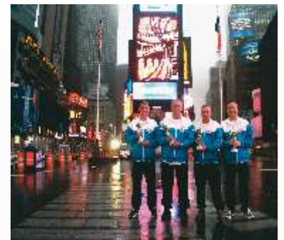
New York, Times square USA